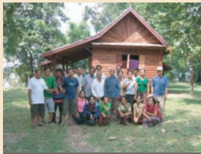
The Community Lodge on Don Daeng

In order to minimize problems in the village and to make your trip more enjoyable, advanced booking is recommended . Contact the District Tourism Office in Champassak or the Provincial Tourism Office in Pakse (+856-031) 212 021 for more information or book in advance through a local tour company.