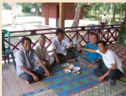
The Community Restaurant

You can also stay with local families. Families can accommodate 2-4 people per household. Sleeping is arranged in a common room. Homestay families have a common bathroom and provide boiled drinking water and sleeping equipment including mosquito nets.