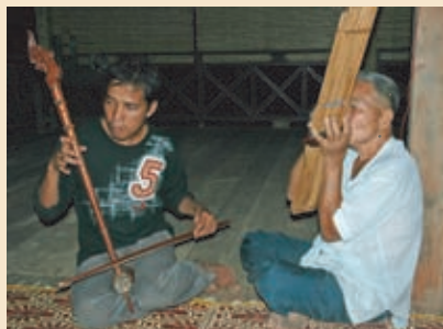
Playing the 'saw ee' & the 'kaen'

The community lodge has 2 common rooms each sleeping 5 people. Mattresses, pillows, blankets and mosquito nets are available. The lodge has two common bathrooms and a common dining area.